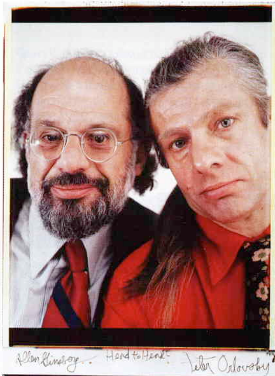
Top: Elsa Dorfman, from The Big Apple Circus series, © Elsa Dorfman, Above: Elsa Dorfman, Head to Head . © Elsa Dorfman.

But getting at the deeper evocation, the spirit of the portraits, the moment : elusive. "I can tell you when it happens," says Dorfman. "There's a split second in time: in creating the moment, taking the picture, catching the moment out of that stream. The art it's closest to is dance." And documentary filmmaking.